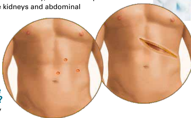
Figure 3. Patient with laparoscopic incisions compared to conventional open kidney surgery scar.

Laparoscopic radical nephrectomy is usually performed for patients with moderate to large kidney cancers (> 4cm in size). Such patients will