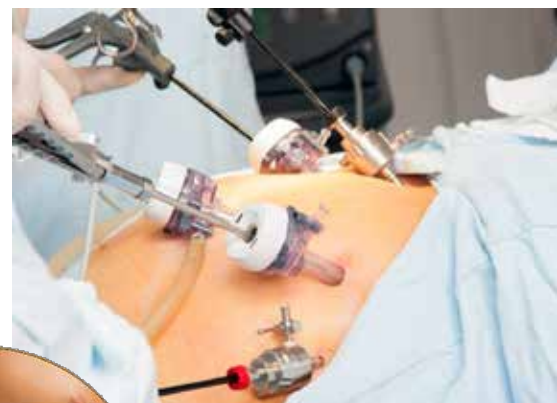
Figure 2. Laparoscopic kidney surgery being performed through small incisions made in the abdomen with specialised instruments and a video camera system.

Laparoscopic surgery may not be the best approach in some rare clinical scenarios e.g. patients with very large or locally advanced kidney cancers, patients who are very sick due to severe kidney infection with haemodynamic instability, and unstable patients with life-threatening trauma to the kidneys and abdominal organs causing ongoing bleeding.